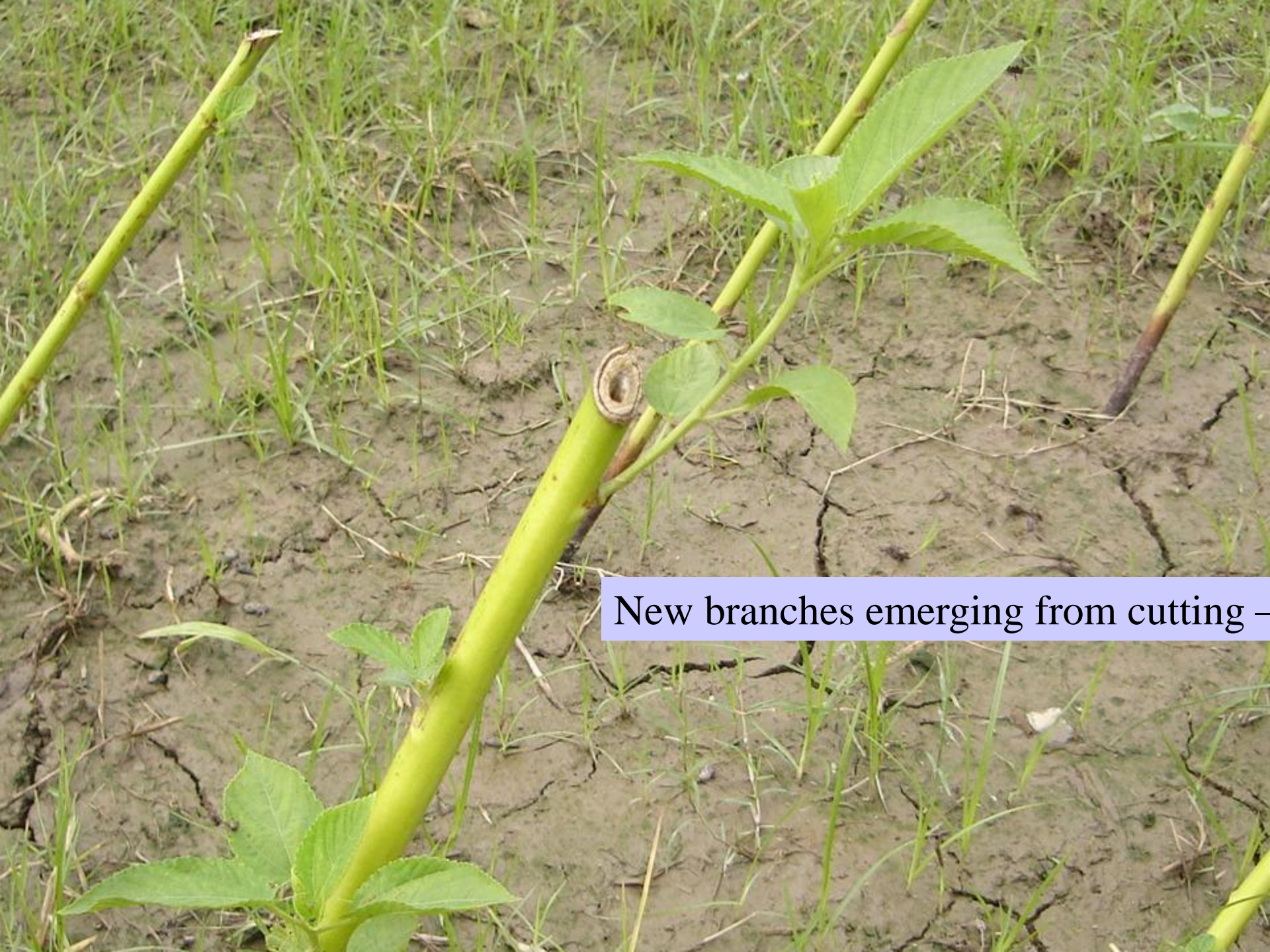
New branches emerging from cutting –