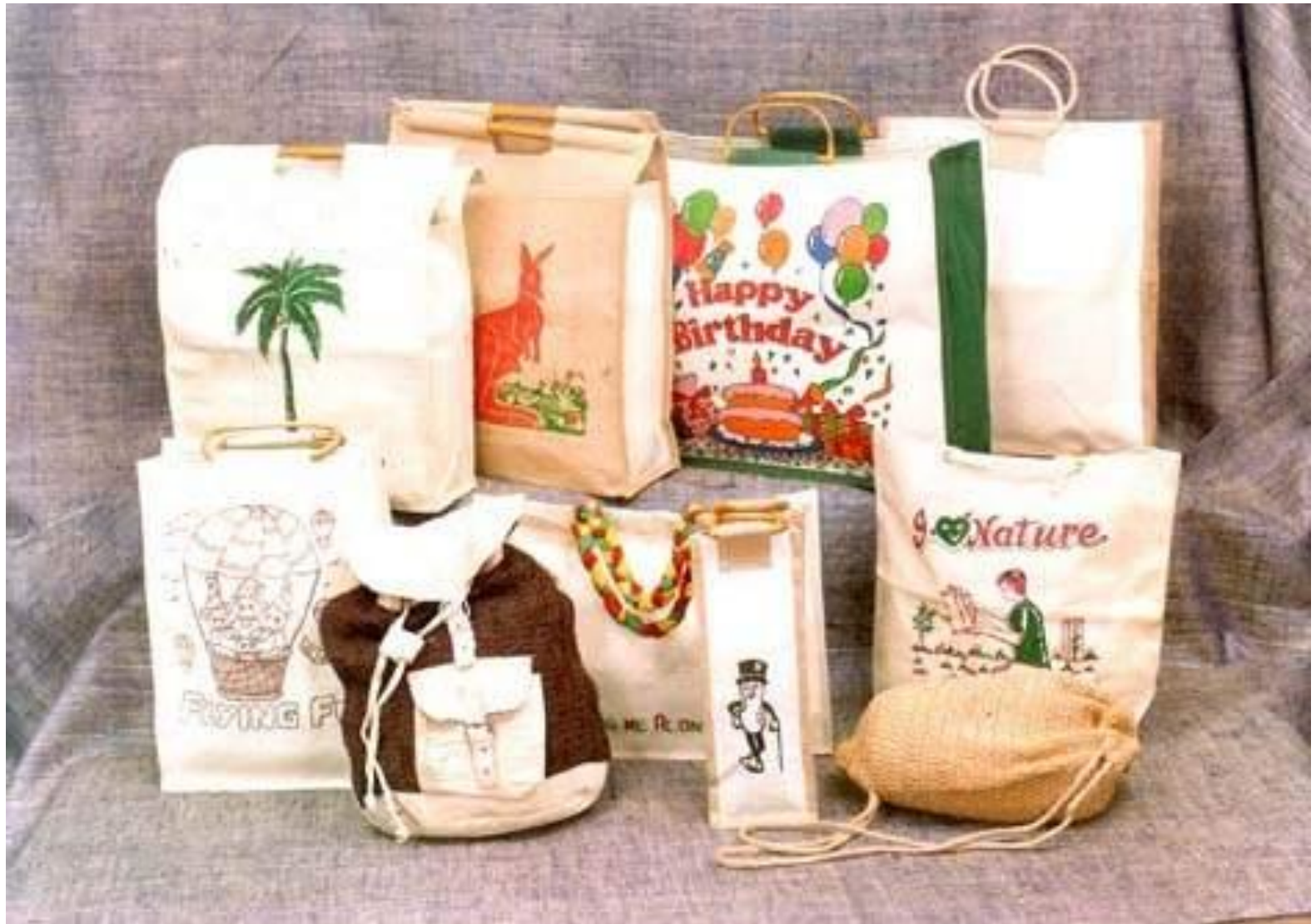
JUTE SHOPPING BAGS