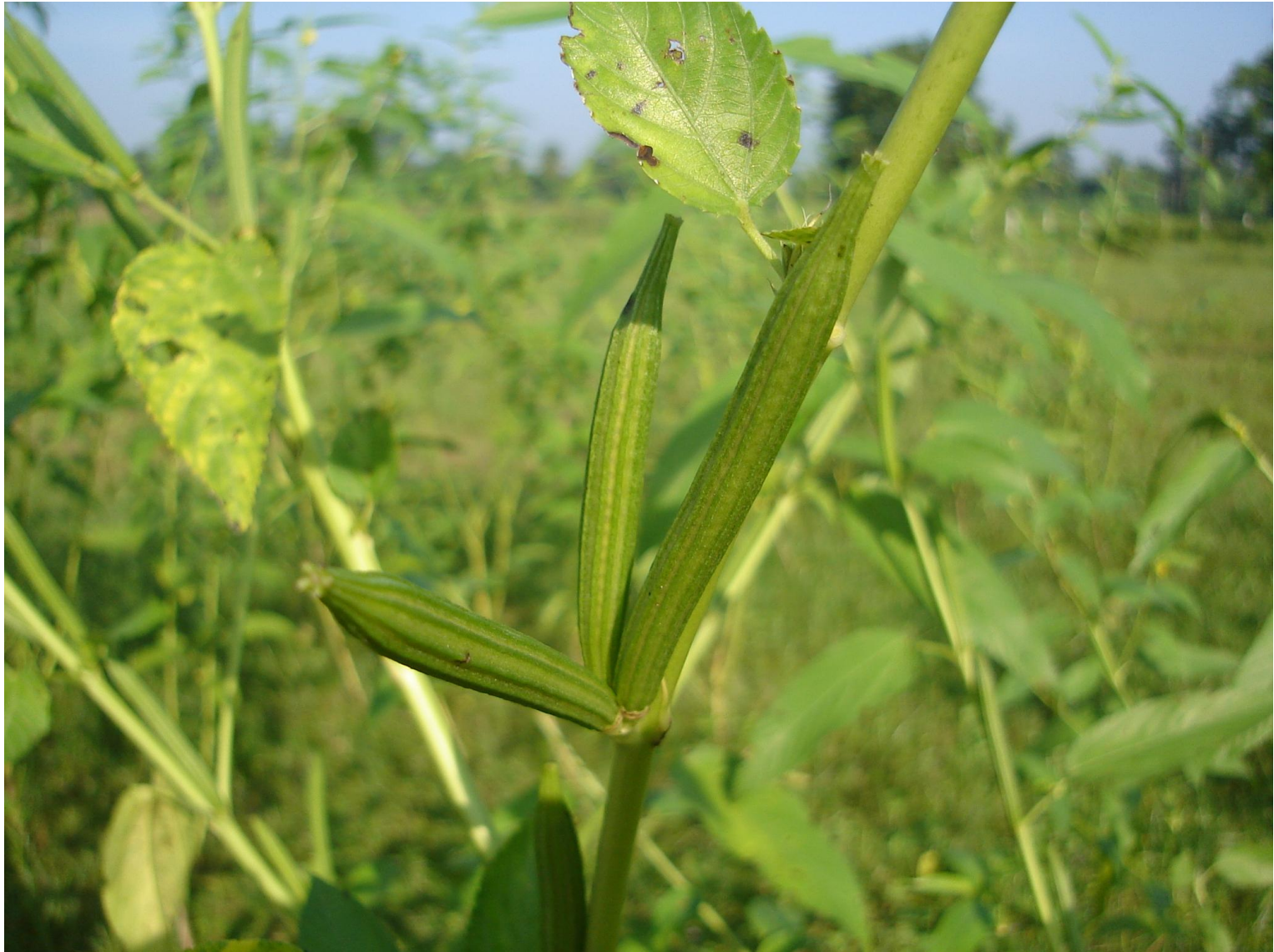
Multiple pod bearing branches in cutting plant