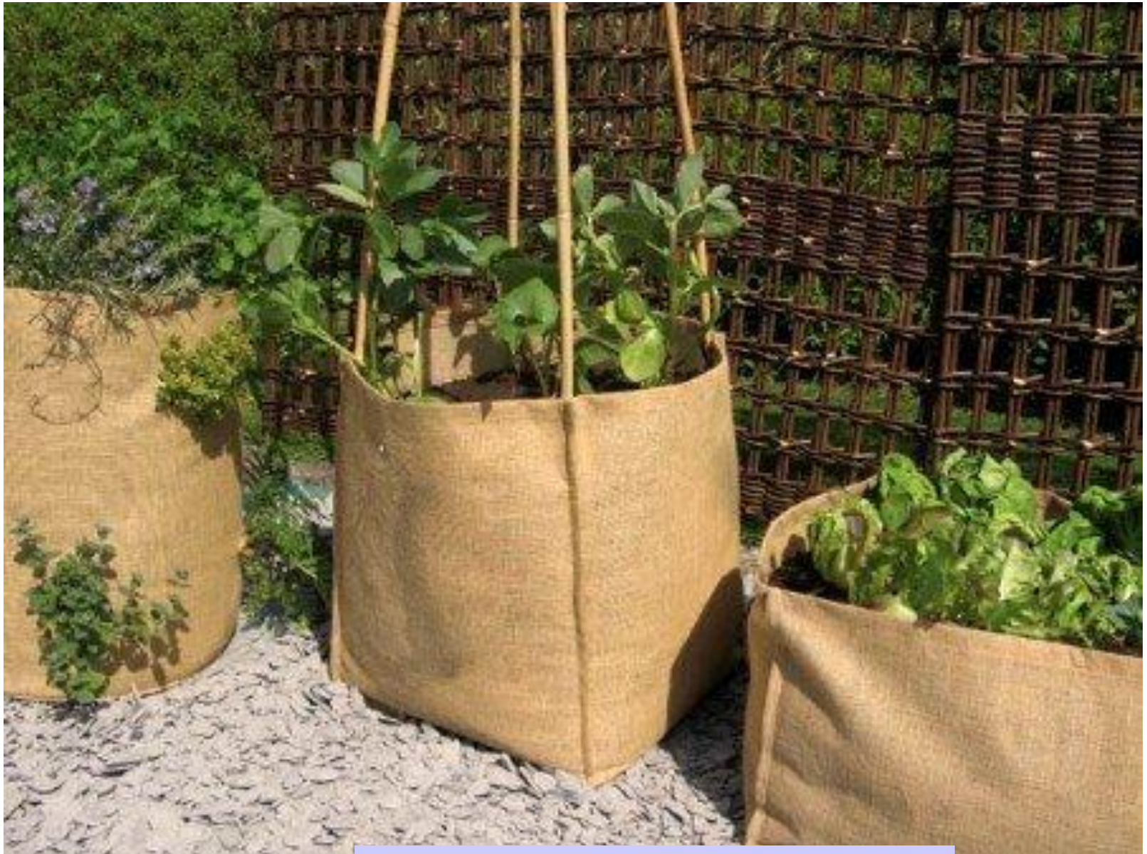
SEEDLING PLANTER BAGS